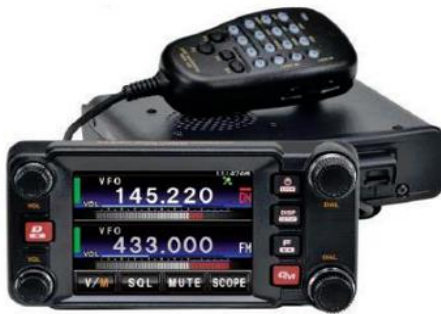
Yaesu FTM-400 DR/DE C4FM FDMA/FM 144/430 MHz 50W DUAL BAND TRANSCIVER