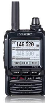
Yaesu FT2DR/DE C4FM FDMA/FM 144/430 MHz 5W DUAL BAND TRANSCIVER